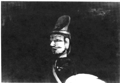
The Faber Birren Color Award – $1000

In all, these artists demonstrated a commitment to reach beyond convention and renegotiate the forms of painting and sculpture so that new windows to our appreciation and understanding of art can constantly flourish."